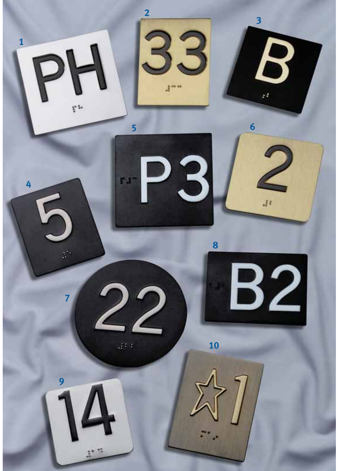
Sizes and finishes shown are for example only. All finishes are available on all sizes.

For other materials or finishes please see page 5.