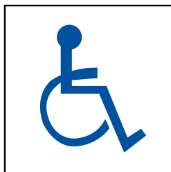
HANDI-77-W 7 x 7