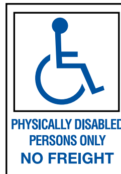
HANDI-710-1 7 x 10